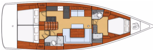
3 cabins - 2 head compartments